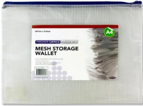
1 x A4 flat plastic folder