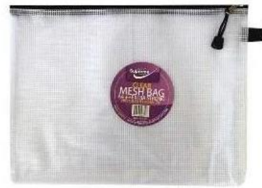
1 x A5 flat plastic folder