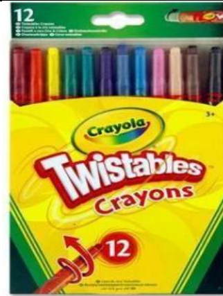
12 Crayola Twistable Crayons