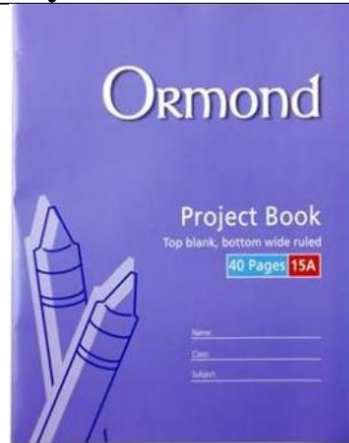
1 x Project Book (40 pages, No. 15A)