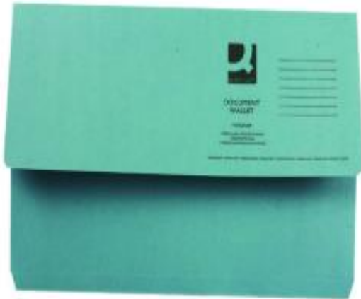
2 x A4 flat cardboard size folders